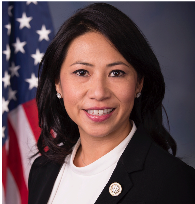
U.S. REP. STEPHANIE MURPHY (D-Florida)